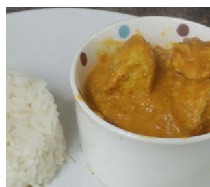
Curry & Rice