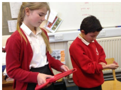
Year 6 taking their pulse after exercise

During the first week of term, the whole school has collaborated on a 'Keeping Healthy Week', perfect for those New Year's resolutions. Each class has taken a different theme including exercise and healthy diet, and produced striking display boards around the school. The children are also enthused by a wide variety of after school clubs on offer, including cookery, book, science, art and orchestra clubs, thanks to the dedication of the teaching staff. The children are fortunate to benefit from a lottery award which will fund many additional sports activities delivered by two professional coaches.