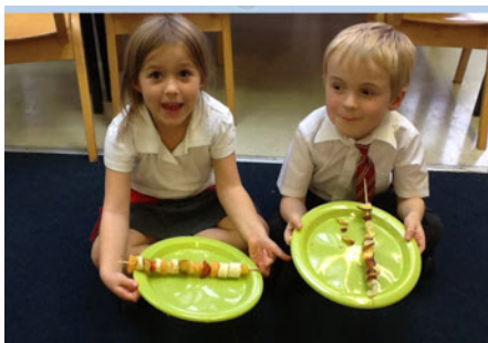
Year 1 made fruit kebabs

All the children had a busy end of term with successful Christmas productions, a carol service with thoughtful contributions from all the classes, a shared Christmas dinner and class parties.