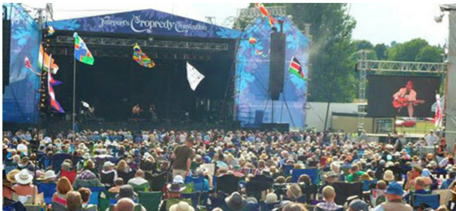
Fake Thackray at Cropredy Festival 2013